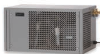
optional remote condensing unit