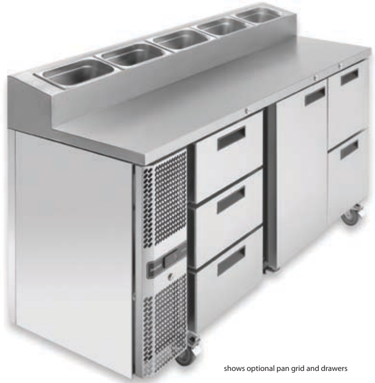
shows optional pan grid and drawers

The self contained side-mounted refrigeration system draws and vents from the front allowing the counter to be built-in to your kitchen. Defrost is automatic and our energy saving vaporiser eliminates the need for a drain