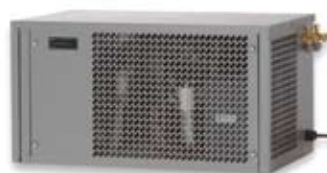
optional remote condensing unit