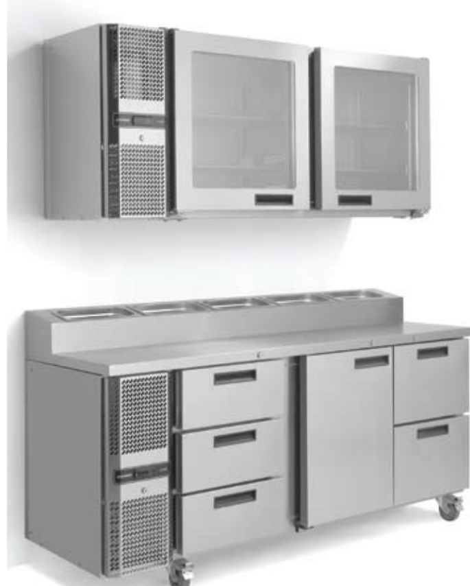
Wall Cabinet is shown mounted above optional Precision Gastronorm Counter

The self contained side-mounted refrigeration system is vented from the front. Defrost is automatic and our energy saving waste heat vaporiser system eliminates the need for a drain.