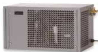
optional remote condensing unit