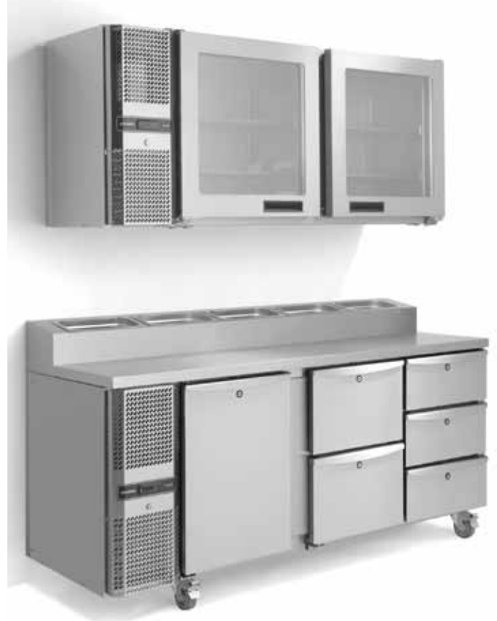
Wall Cabinet is shown mounted above optional Precision Gastronorm Counter

The self contained side-mounted refrigeration system is vented from the front. Defrost is automatic and our energy saving waste heat vaporiser system eliminates the need for a drain.