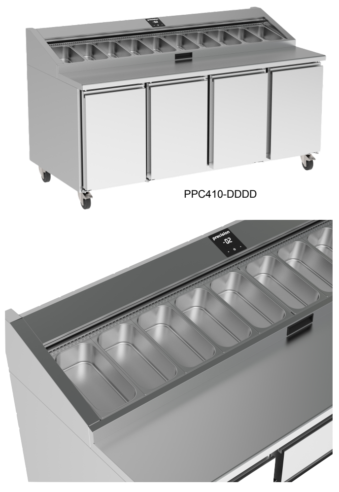
GN 1/3 Pan Layout

Whether it be for salads, pizzas, sandwiches, tapas, desserts and much more, these prep counters are perfect for those who need to maintain their ingredients at safe temperatures all day long.