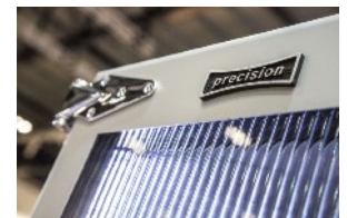
Ribbed Glass Option