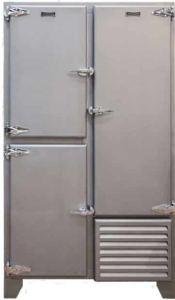
HRU2 - Solid Doors

On the inside, a modern professional refrigerator with the latest energy-efficient features and perfect temperature control. On the outside, vintage retro styling that makes a striking focal point of any bar or kitchen. It's cutting edge technology perfectly combined with classic vintage looks.