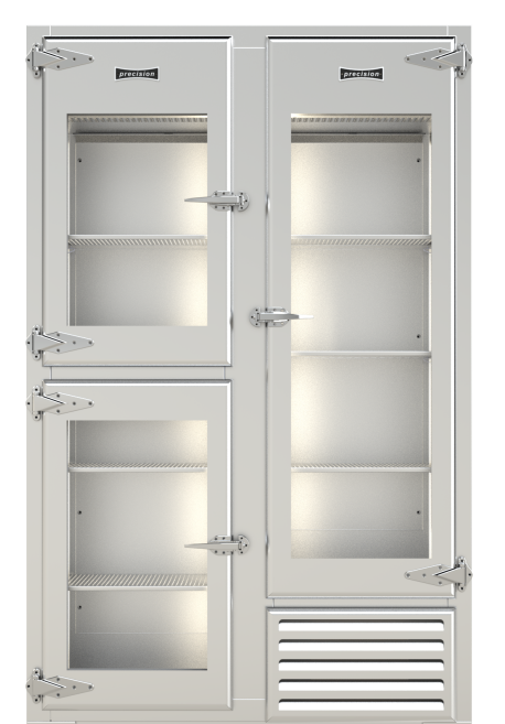
HRU2 - Glass Doors