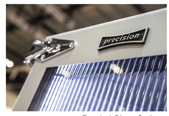
Reeded Glass Option

Give us a RAL number and we'll paint your retro refrigerator to match any colour you can dream of.